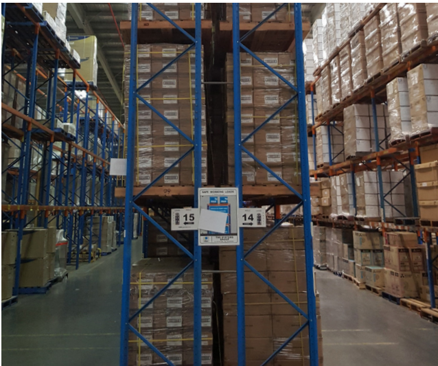
Left aisle shows existing lighting quality, new lights are installed on right