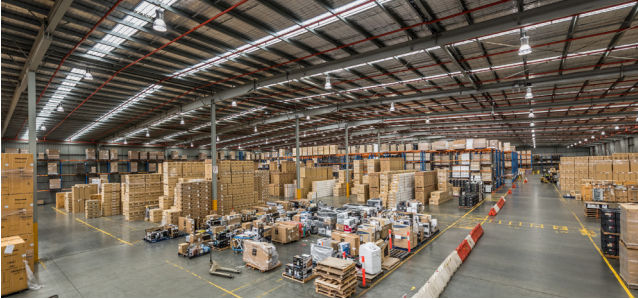
Warehouse after the installation