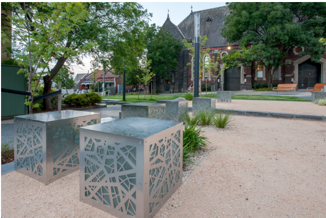
Lightboxes during the day