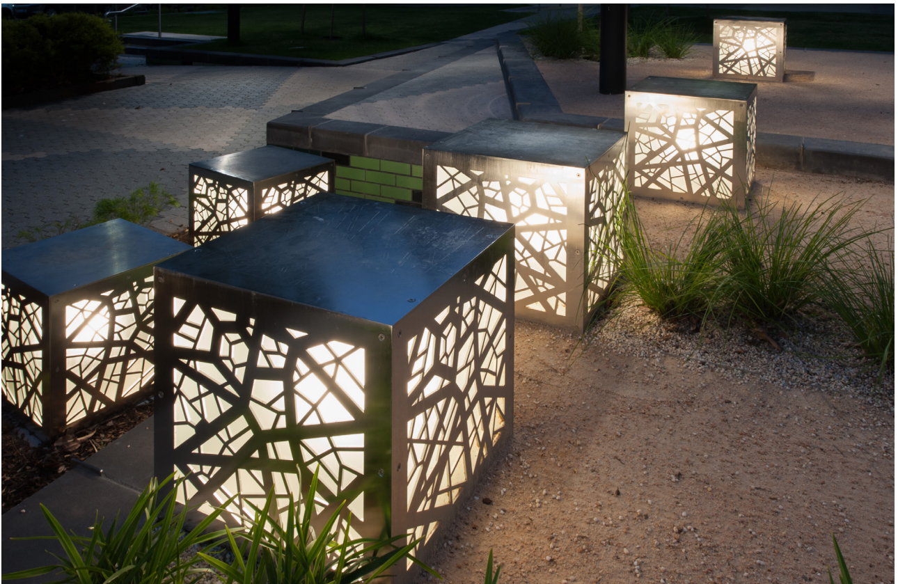
Lightboxes during the evening