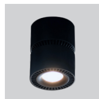
Custom made pendant