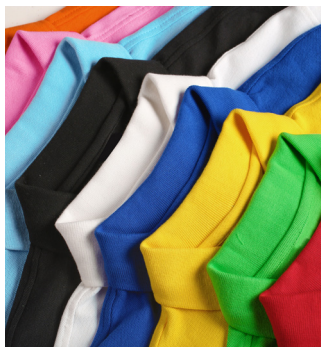
Brilliant Vivid LED 3000K CRI 97