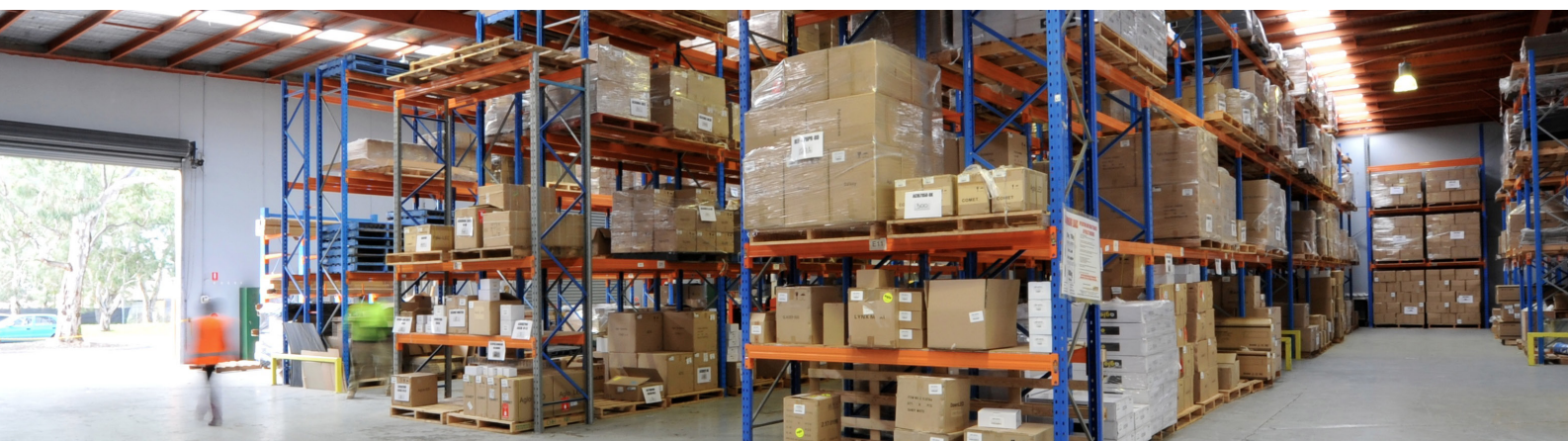
An extensive product range is held at Aglo's warehouse