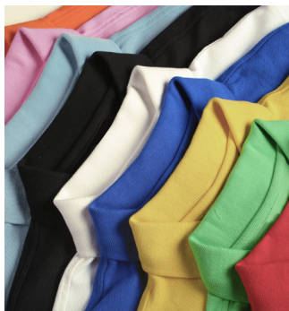
Standard LED 3000K CRI 80