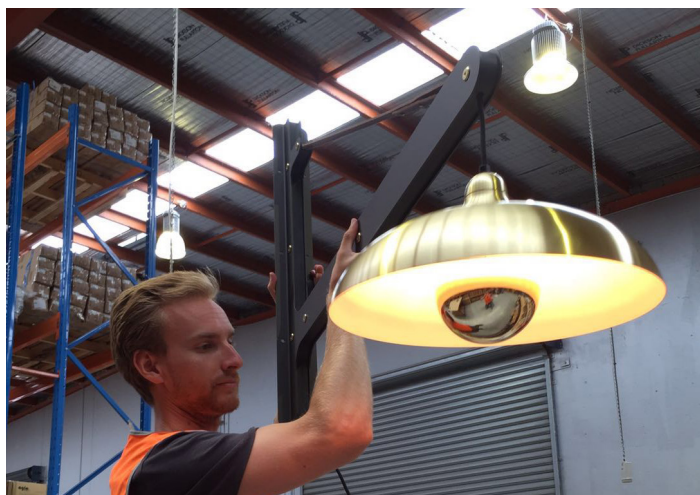
Prototype production of dining room pendant